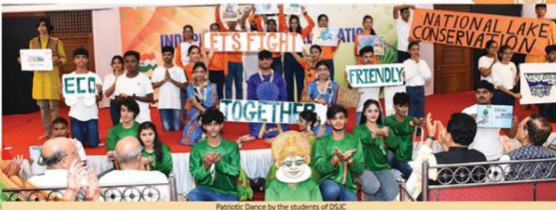
Patriotic Dance by the students of DSJC