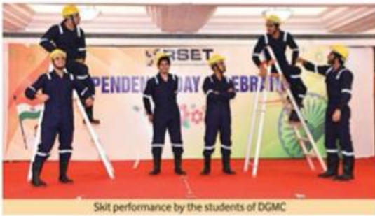
Skit performance by the students of DGMC