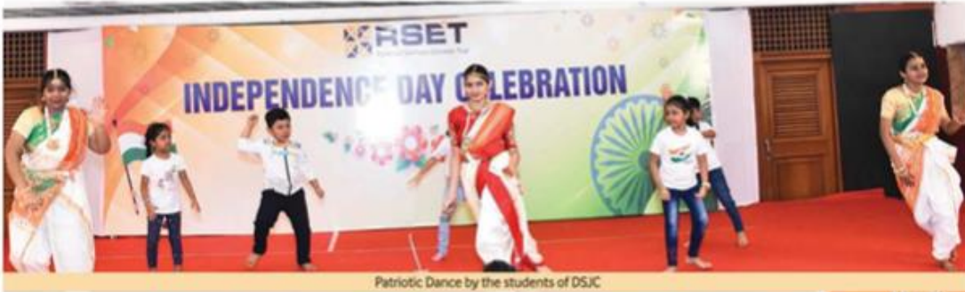
Patriotic Dance by the students of DSJC