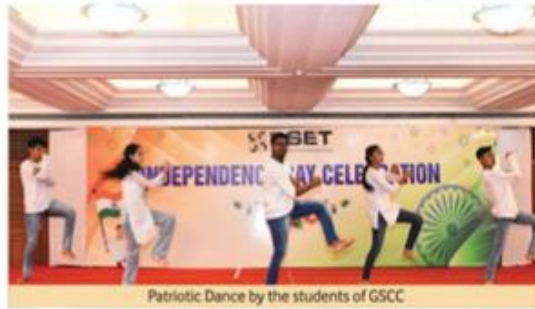
Patriotic Dance by the students of GSCC