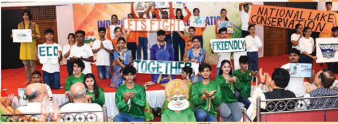
Patriotic Dance by the students of DSJC