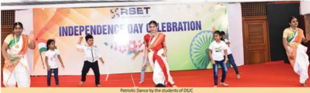
Patriotic Dance by the students of DSJC