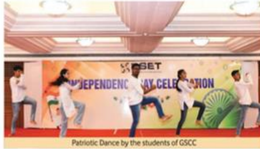
Patriotic Dance by the students of GSCC