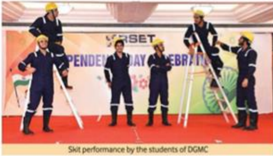
Skit performance by the students of DGMC