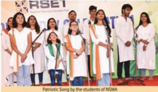
Patriotic Song by the students of NSMA