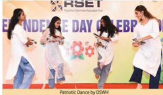
Patriotic Dance by DSWH