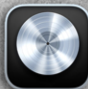
Logic Pro X