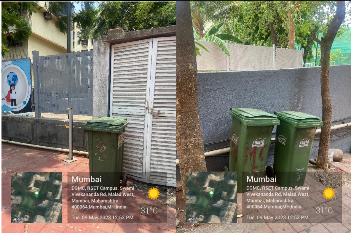
Waste Segregation Bins installed around the campus