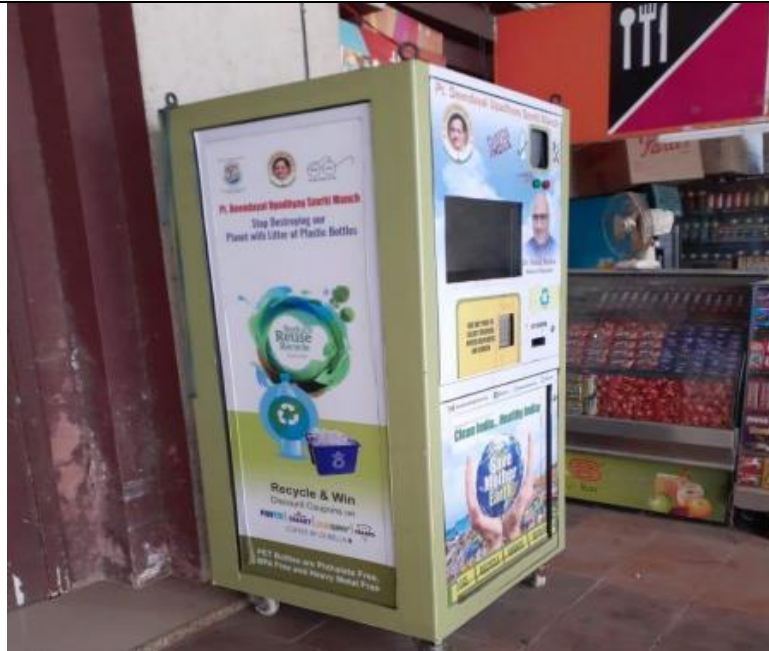
Plastic Bottle crushing Machine installed in the Canteen

Deviprasad Goenka Management College of Media Studies (DGMC) RSET Campus, S. V. Road, Malad (w), Mumbai 400 064, Maharashtra, India